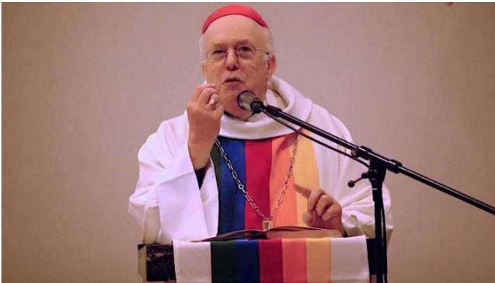
Cardinal Danneels in Rainbow vestments

Cardinal Godfried Danneels, the emeritus archbishop of Brussels, was a personal appointment by Pope Francis to the Synods of Bishops on the family. In addition to wearing rainbow liturgical vestments and being caught on tape concealing sexual abuse, Danneels said in 2013 of the passage of gay “marriage”: “I think it’s a positive development that states are free to open up civil marriage for gays if they want.”