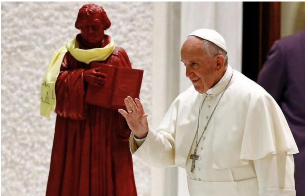
Pope Francis next to a statue of Martin Luther

The Pope spoke to an audience before a statue of Luther in the Vatican just prior to his going to Sweden to help launch the 500 th anniversary of Lutheranism. The