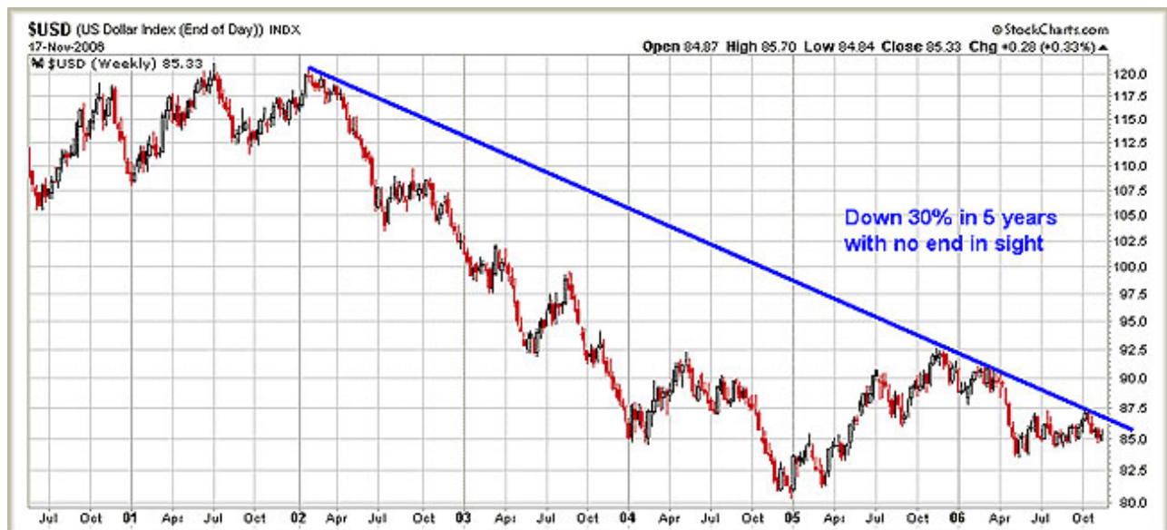
This chart shows the downward slide of the US dollar, which went down 30% in five years.

The US dollar is sinking very quickly, and if it collapses, and it seems to be heading in that direction, then America would be removed as a global power. Now in 2008, gas is three dollars a gallon, which is 150% higher than it was in 1967. This is not accidental; the International Bankers want the Americans to accept a global currency, as the countries of the European Union now have. South and Central American economies will be severely affected, as well as the Asian community which has invested heavily in the United States.