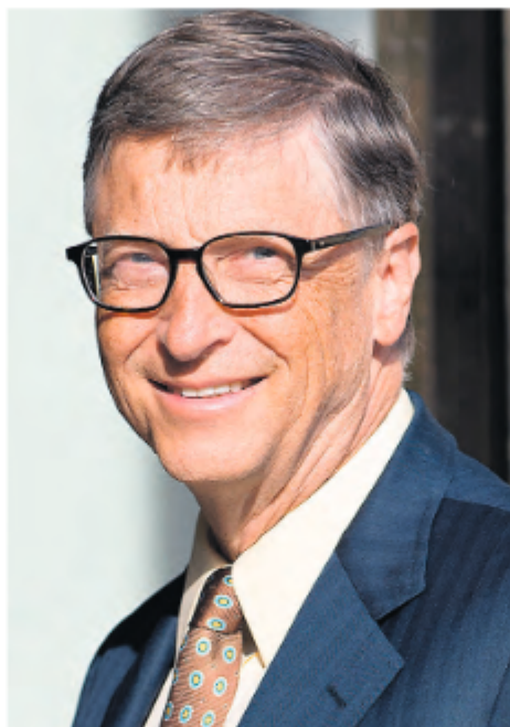
Bill Gates, co-founder of the Bill & Melinda Gates Foundation